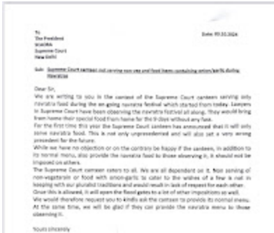
WhatsApp Image 2024-10-04 at 1.07.04 PM.jpeg 126K